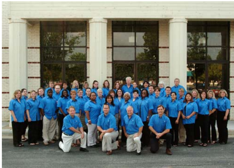
InforMed's Medical Management Team